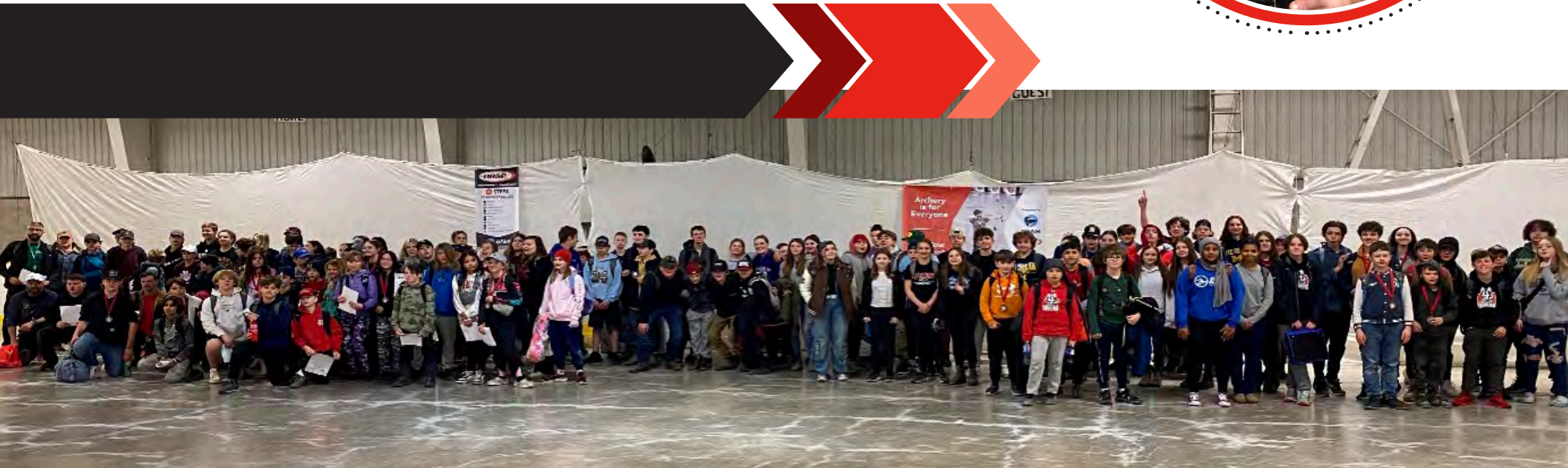
Photo above: 2024 LIVE event held in Keady, ON. Over 125 kids participated!