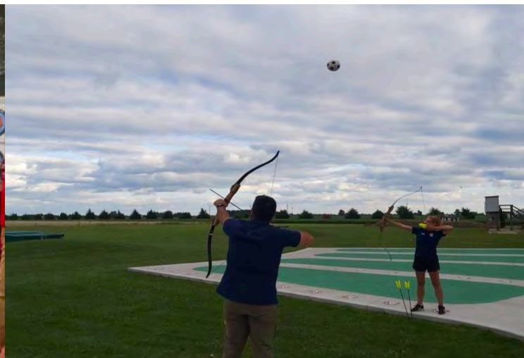
Photo: Arrow Trap at Archery Windsor Fun Night