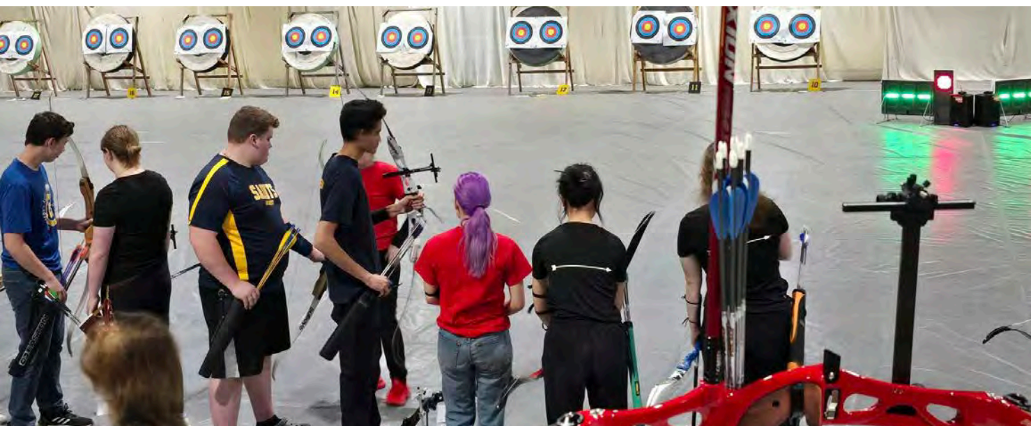
Photo above: Athletes on the line at the annual high school archery invitational tournament in May 2024.