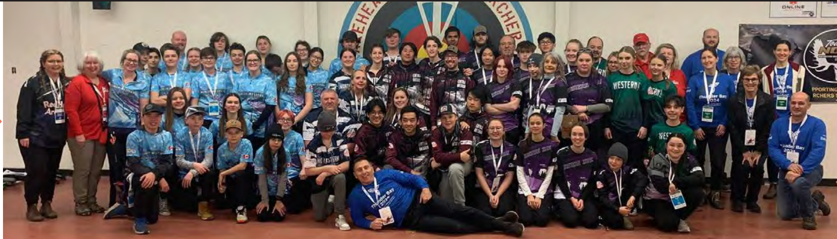
Photo above: All archers, coaches and officials at the 2024 Ontario Winter Games! This was a milestone moment. It was the first time ever that archery was included in the OWG.