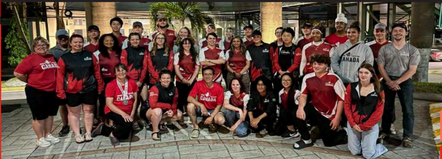
Photo above: a large showing of Ontario archers on national teams at YMPAC, and WAFC, as well as other national team events including the Olympics and Paralympics, 3D world champs, World Cups, etc.