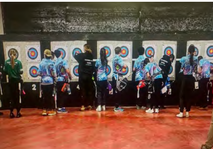
Photo: Practise at the Ontario Winter Games.