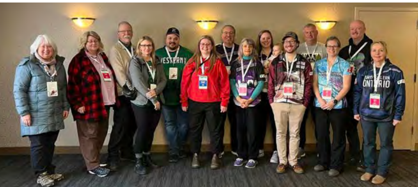
Photo to the Left: Officials, Coaches and Managers from the ON Winter Games